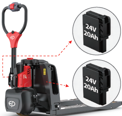
Heavy-duty Estimated real life working time: 11hrs

The FlexiTruk 1500 brings maximum flexibility in configurations for every application, from occasional usage to heavy duty. Featuring a two power slot design, FlexiTruk offers the option of two 24V/20Ah batteries to maximize runtime for full-time applications. The standard single-battery setting comes with a portable storage container to keep everything easily accessible on the go. Its versatility makes FlexiTruk an all-rounder, perfect for diverse tasks in the most cost effective way.