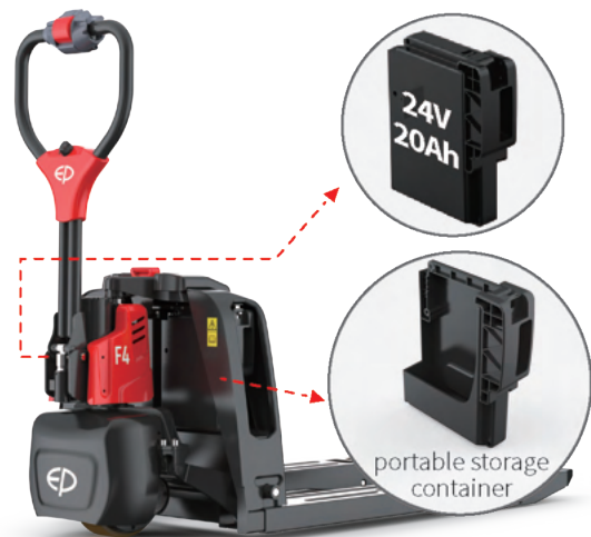
Occasional usage Estimated real life working time: 5.5hrs